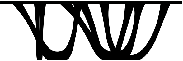
Table final dimensions to be agreed with the customer*