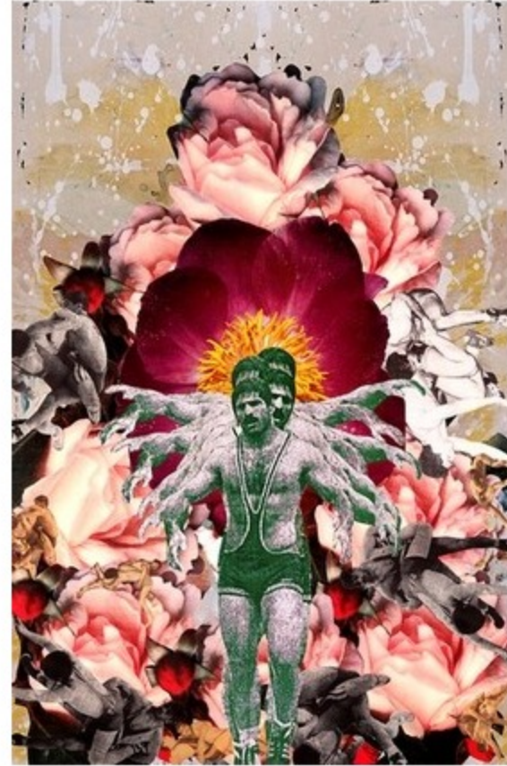
Radioactive Rostam by Fereydoun Ave.