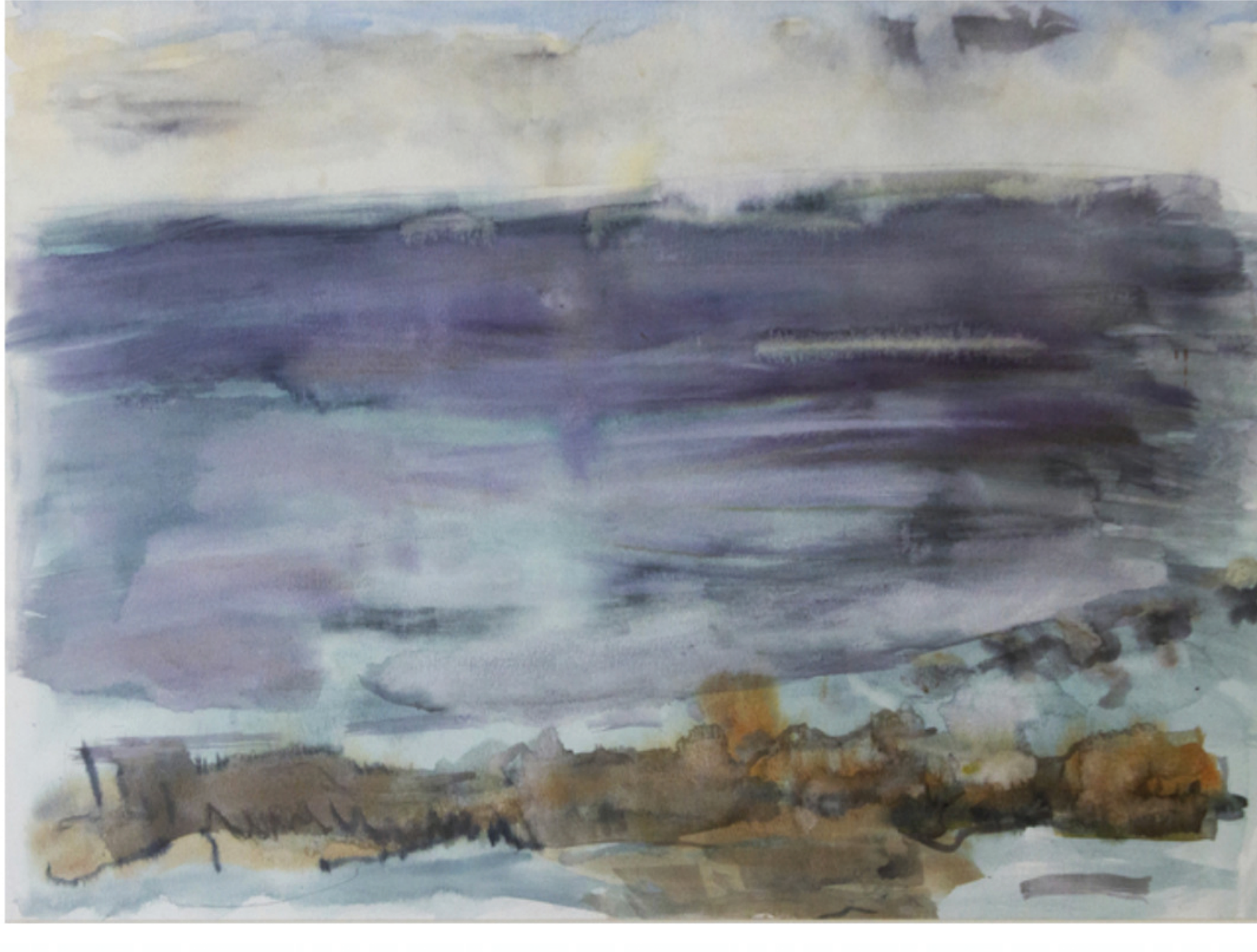
The Oil Beach Village , 2000. Water colour and acrylic on paper, 43 x 58 cm.

This online exhibition curated by Gallery One, from Ramallah in Palestine features artworks by Abed Abdi, Benji Boyadgian, Hosni Radwan, Zohdy Qadry, Juliana Seraphim and Saleh Abu Shindi. United by the medium of paper, the show includes this watercolour landscape by Zohdy Qadry who spent much time studying in Russia and includes themes of nostalgia in his work. Other highlights include a stunning piece from 1971 by Juliana Seraphim, whose mystical and surreal compositions reveal a fascination with imagined dream-scapes and can transport viewers to another realm.