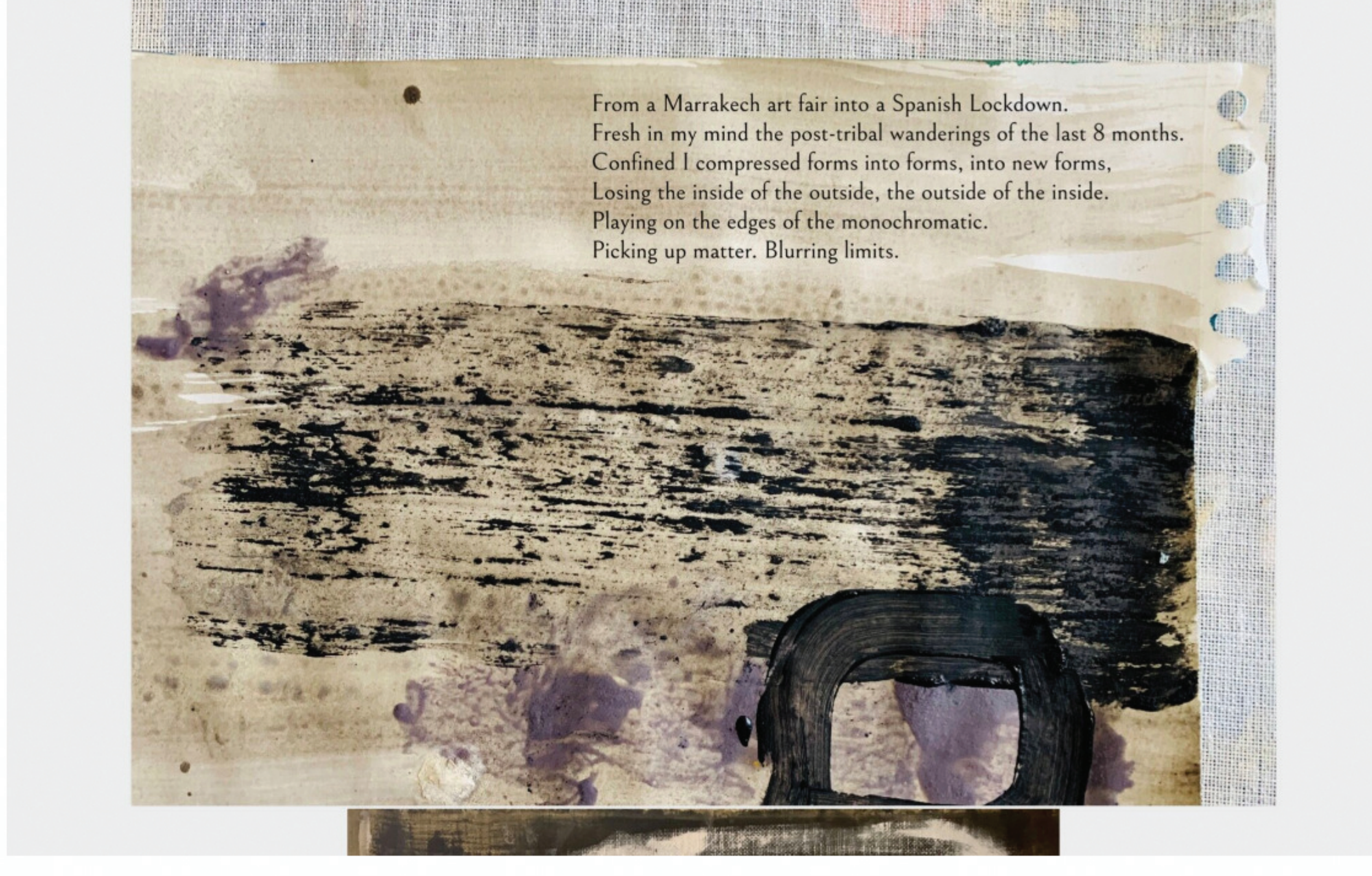
Screenshot from the PDF catalogue of Let's Get Lost (Let Them Send Out Alarms) by Firouz FarmanFarmaian

Let's Get Lost (Let Them Send Out Alarms) was produced under the ongoing international lockdown and reflects on the idea of confinement, brought into the heart of the artist's own practice.