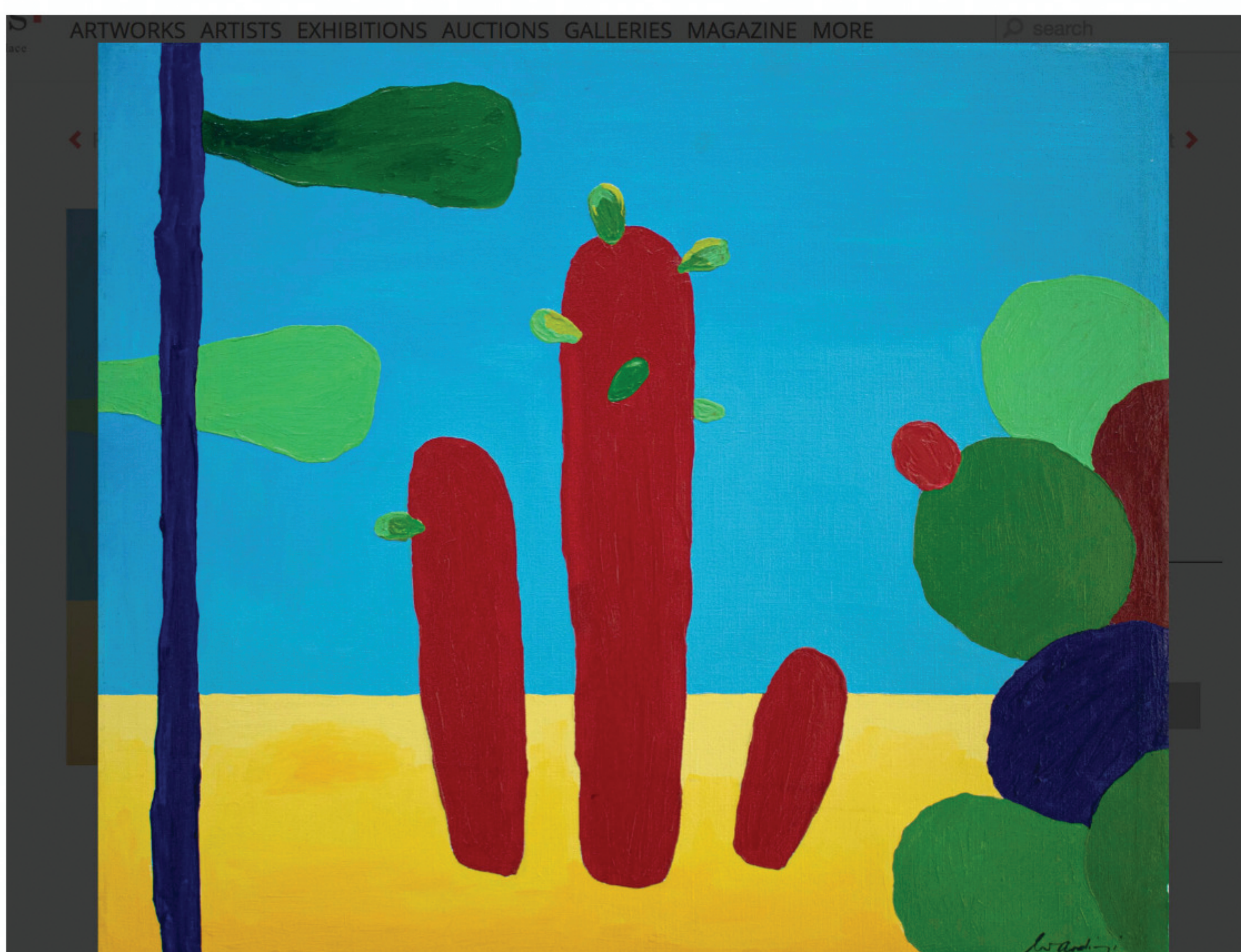
Willy Aractinigi, Les Cactus (1973). Oil on canvas. 70 x 80 cm. Signed.

Artscoops is a digital marketplace for art from the MENA region, with a focus on modern pieces particularly from Lebanon. They host regular auctions, and for this one, 10% of the buyer's premium will be donated to the Lebanese Red Cross to help those affected by the impact of the COVID-19 pandemic. This image is one of the star lots. Continuously inspired by fables and folklore as well as the natural world, Willy Aractinigi was born in New York in 1930, raised in Cairo and settled in Beirut. He uses bold colour and pigment, in this particular work, the cactus is symbolic of resistance and patience.