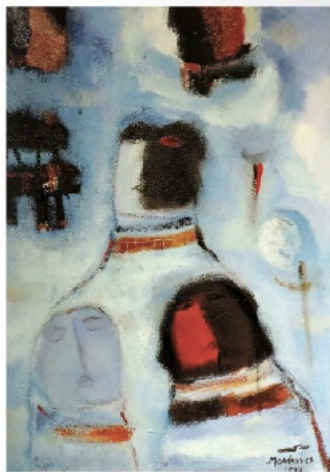
Above: Untitled by Fatch Mouscoris, oil on canvas, 60 cm x 62 cm