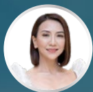
Ma. Esperanza Christina Garcia Frasco

Tourism Secretary Philippine Department of Tourism