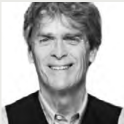
SIR JOHN HEGARTY Advertising Executive & Founder, BBH & The Garage Soho