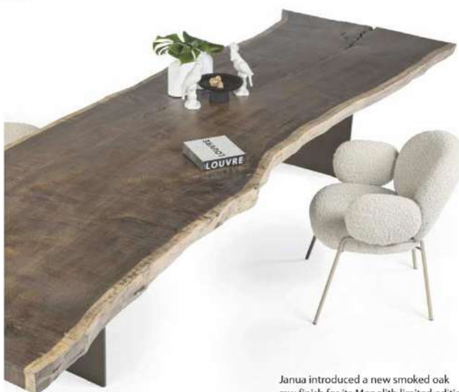
Janua introduced a new smoked oak raw finish for its Monolith limited edition tables: only a handful are made each year