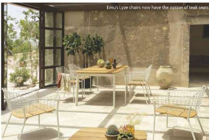
Emu's Lyze chairs now have the option of teak seats