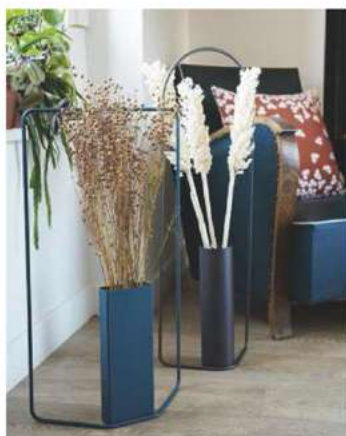
Fermob's rectangular and cylindrical ITAC vases bring the outside in and are available in four colours