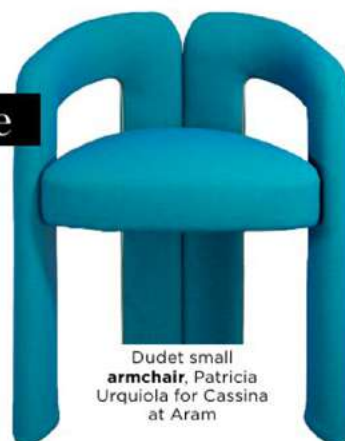
Dudet small armchair, Patricia Urquiola for Cassina at Aram