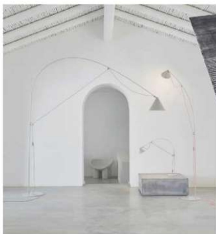
Midgard introduced a white option to its Ayno Silk lighting collection