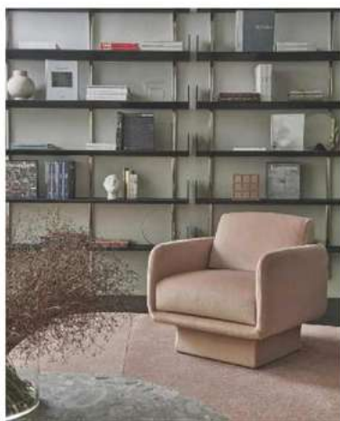
Gallotti & Radice's Lilas is available in fixed or 180deg swivel movement with return action versions

The shiny metallic surface of Kymo's Melting Lines is regularly interrupted by fine lines that create an almost technical pattern. And yet they look as if they have been artistically engraved. If you look at the surface from the other side, the lines merge almost magically with the background and are barely perceptible.