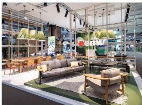
Stand de Ceramica en el salón EquipHotel 2022 en París, abril de 2022