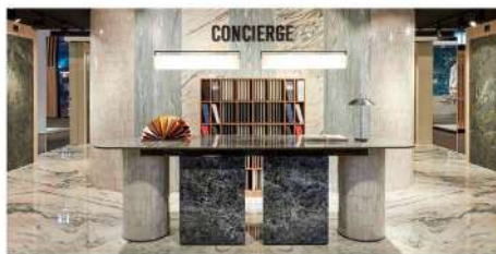
El stand de Ceramica en el salón EquipHotel 2022 en París, abril de 2022