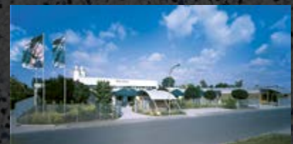
Silikal production and administration in Mainhausen, near Frankfurt/Main, Germany.

Contact us. We would be pleased to go into detail with you – at no cost or obligation to you, of course.