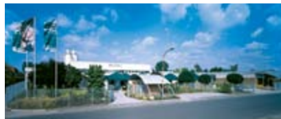
Silikal production and administration in Mainhausen, near Frankfurt/Main, Germany.