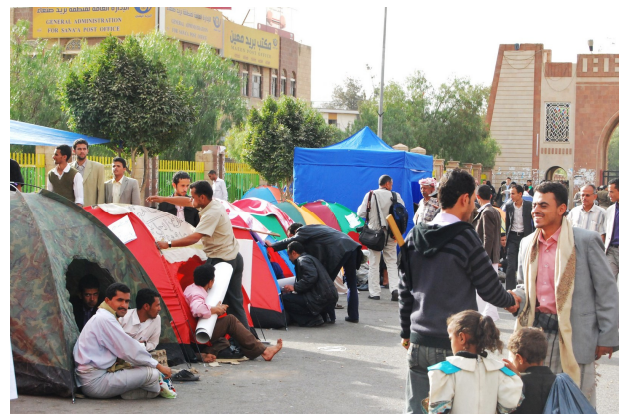
Colorful tents fill the square of change in front of Sana'a University's Eastern gate

The pro-change sit-in is located outside Sana'a University's eastern gate, in an area now called Square of Change because entering the square feels like a new Yemen. From one entrance, a large sign greets people “Welcome to the first kilometer of dignity.” On the other side, a sign reads “Welcome to the land of liberty.” Coincidentally, at the heart of the square is an obelisk engraved with a hadith “Faith is Yemeni, and wisdom is Yemeni” and the streets surrounding the area are al-'adl (justice) and al-Huriya (freedom) streets. With time protestors expanded to cover three kilometers. Colored tents represent the diversity of backgrounds present. To identify the tents, most have signs of their affiliation with a youth coalition, movement, family name, and/or organization.